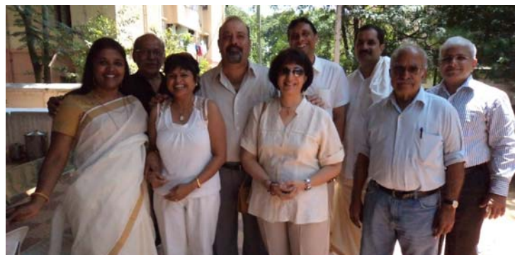
Happy Rotarians & Annes