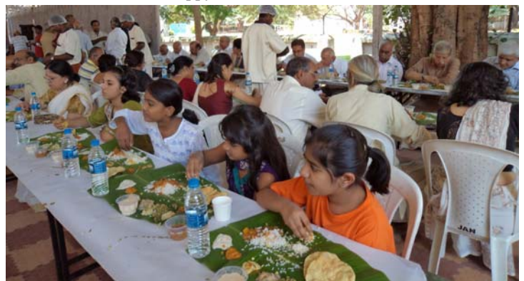
Annettes enjoying their lunch